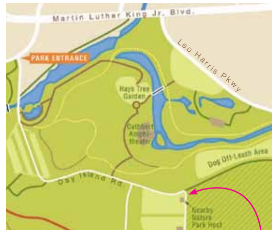
The Water Wise Garden is located next to the Nearby Nature Park Host in Alton Baker Park

University of Oregon urban farm students: volunteer labor