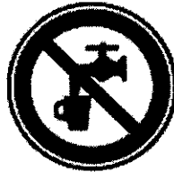
Universal Symbol for Non-Potable Water